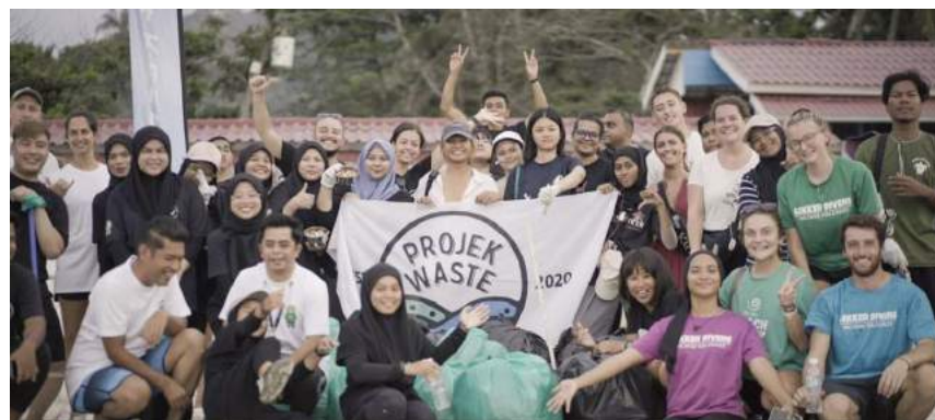
Long Beach & Coral Bay

Feeling inspired? Lead your own clean up!