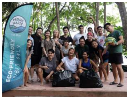
Pulau Perhentian Besar