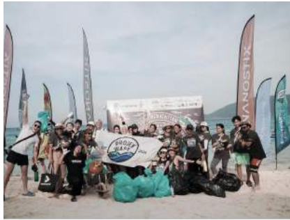
Long Beach @ Surf Perhentian