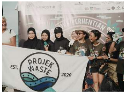
Long Beach @ Surf Perhentian