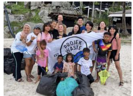
Long Beach x Breeze For You