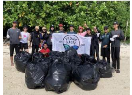
Panglima Abu Beach by UTP

Ready to lead your own cleanup? Let's make it happen!