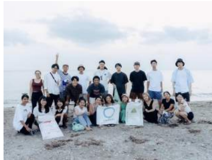
Kemigawa Beach by Uminari