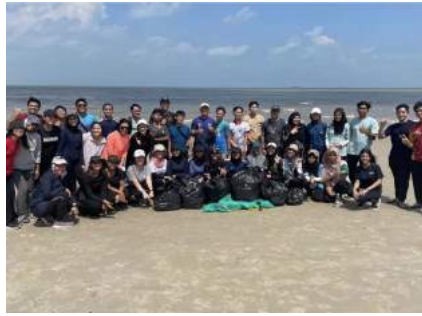
Pantai Morib by Charisma Movement