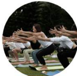
Yoga Class Pass