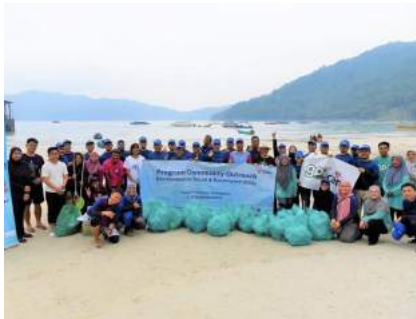
Long Beach by TNB, 5P & Geng Plastik Ija