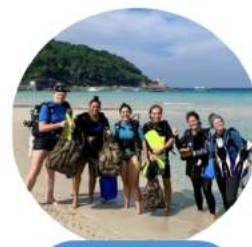
Clean Up Dive

To wrap up the year and thank our wonderful supporters, we put together a giveaway featuring prizes from 3 local businesses dedicated to climate action: ocean conservation, mental and physical well-being, and sustainable fashion.