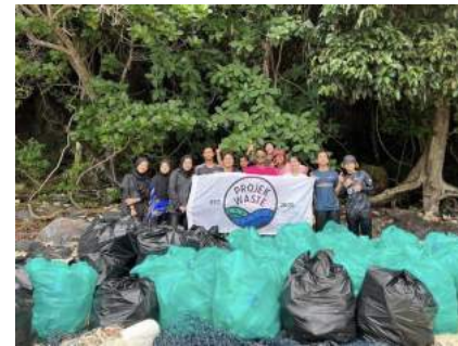
Susu Dara Beach by UTP