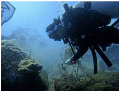
Seabell Rock & Kerma Darat